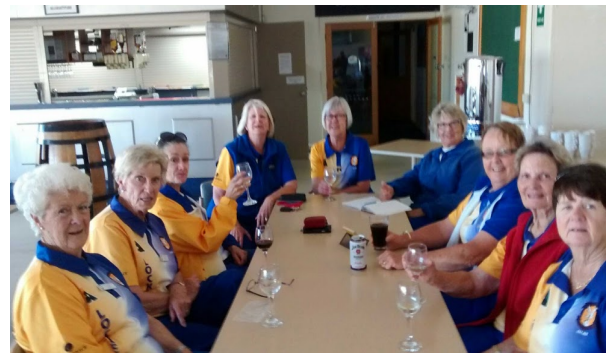
and relaxing afterwards back at the Club ...

Postscript: Well done to the 2 nd side on Wednesday for an emphatic win over Port Adelaide (90-64) and our Thursday sides for both winning their opening games of the season. Great result in particular for the Women's 1 st side in defeating Club Holdfast in Premier League 70-63.