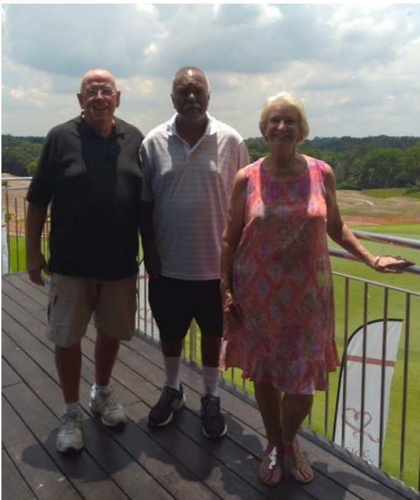
On the balcony of the Singapore Island Country Club, overlooking the golf course

If you haven't been recently, Singapore is a great place to visit. Absolutely amazing infrastructure, unbelievable transport network, great and cheap food, more shops and boutiques than one can imagine, everywhere is spotlessly clean and very safe, and the people are both friendly and everyone speaks English. And, of course, David is there for several months each year ..!